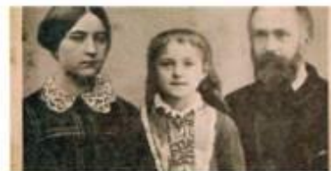
Sts. Zelig and Martin with

Step 3: Send your completed essay with your contact information to vocations@peterboroughdiocese.org by October 30 th .