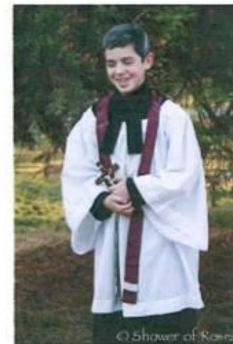
St. John Vianney